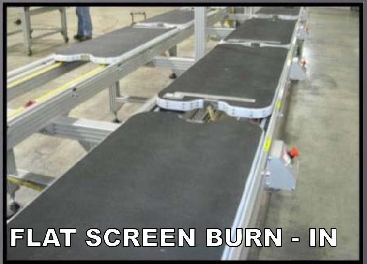
FLAT SCREEN BURN - IN