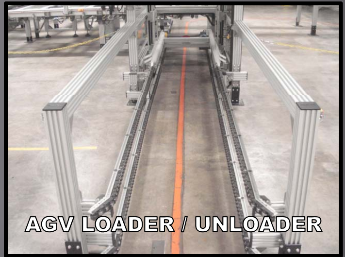
AGV LOADER / UNLOADER