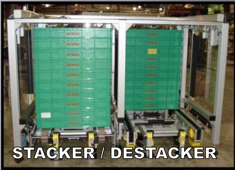
STACKER / DESTACKER